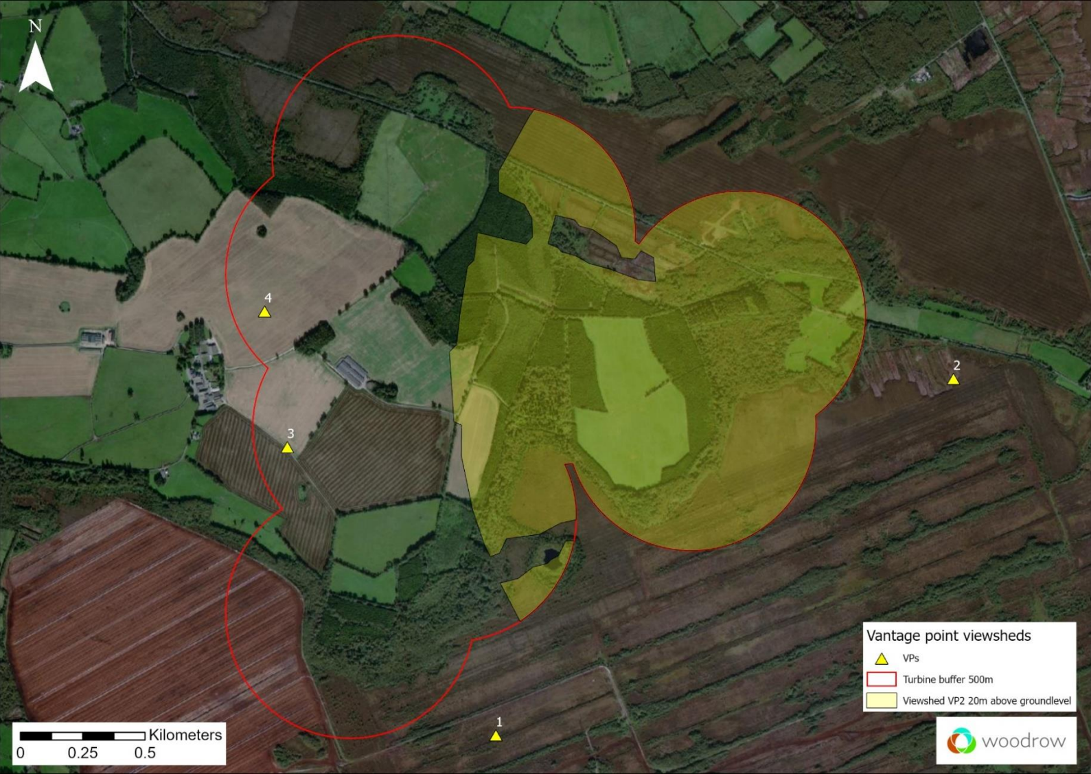
Figure A5.2.2: Viewshed at 20m above ground level – Vantage Point 2