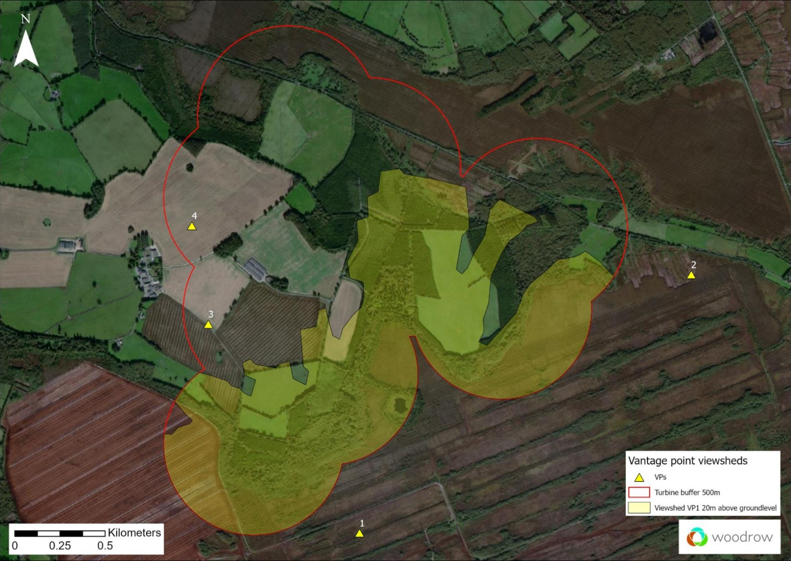
Figure A5.2.1: Viewshed at 20m above ground level – Vantage Point 1